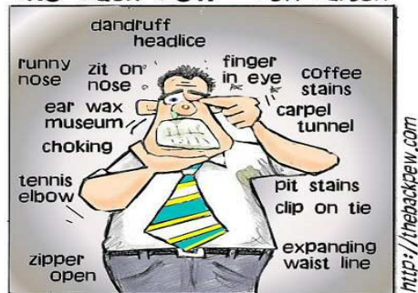
Church Body in Turmoil I Corinthians 12:12-26