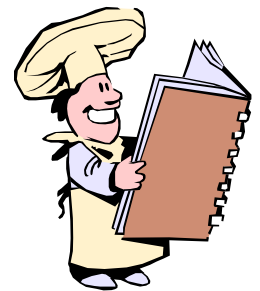
Cooking is an art.