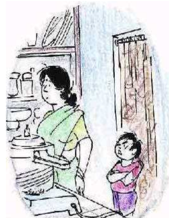
"How come you have given me only a name but no password?"

I know you're surprised to hear from me. They have computers here now, and we are allowed to send e-mails to our loved ones. I've just reached safely and have been checked in. I see that everything has been prepared for your arrival tomorrow. Looking forward to seeing you then! Hope your journey is as uneventful as mine was.