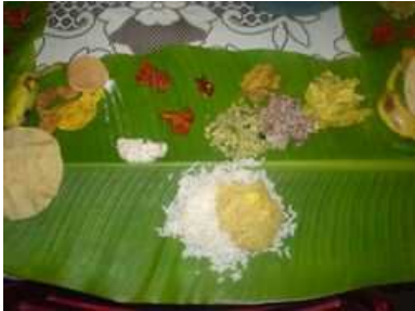
Onam is the biggest festival in the Indian State of Kerala

Onam has been part of Malayalee psyche for centuries. There are records of Onam being celebrated during the Sangam Age. The earliest record of Onam is found during time of Kulasekhara Perumals around A.D. [800], soon after the Kalabhra Interregnum of Kerala History. Until the eighth century the political history is mostly unknown and is usually known as the