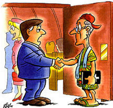
"Pastor, about this new idea to reach teens..."